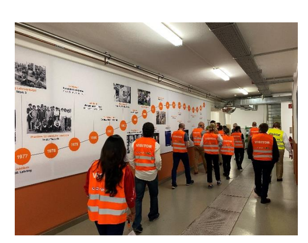
The group making their way into Blum Austria's factory

The group visited 4 of the 8 factories in Austria. Our Headquarters, engineering and our apprenticeship facility, and two of our newest and largest production facilities in Dornbin.