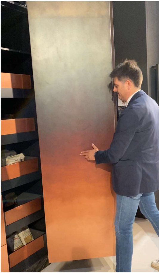
Photo: DNA3 booth with REVEGO by Blum

Whether your space is large or small, there seems to be a trend for pocket doors in the home. Perhaps a small office space can be hidden when not in use or maybe you want to create a room separation in an open concept layout. You may want to hide dirty dishes after hosting some guests at your home. We saw these systems everywhere and they work very well! Many operated with a very light touch and even partially opening and closing with a slight touch.