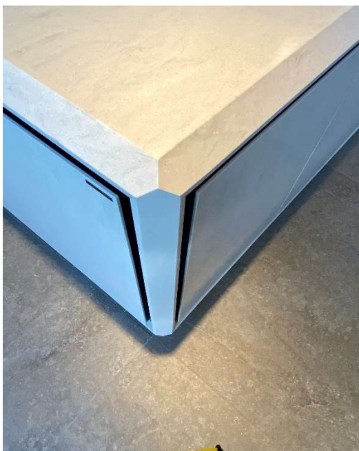
Mitered Edges/Stone fronts