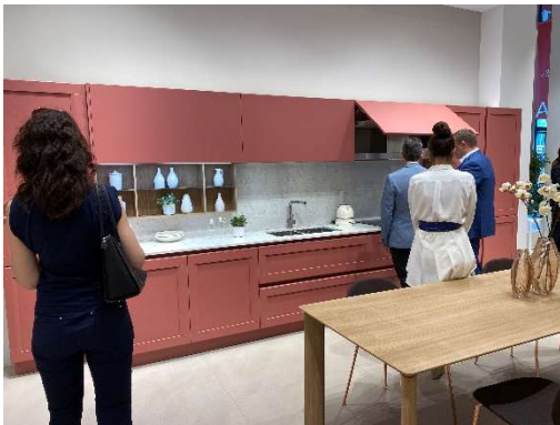
Kitchen: Veneta Cucine

We saw thick doors as well as thin doors using solid surface, heavy materials. Upper and lower cabinets were designed and constructed with the same material as the countertop to create a complete waterfall look of the whole kitchen making it appear as one piece of beautiful furniture.