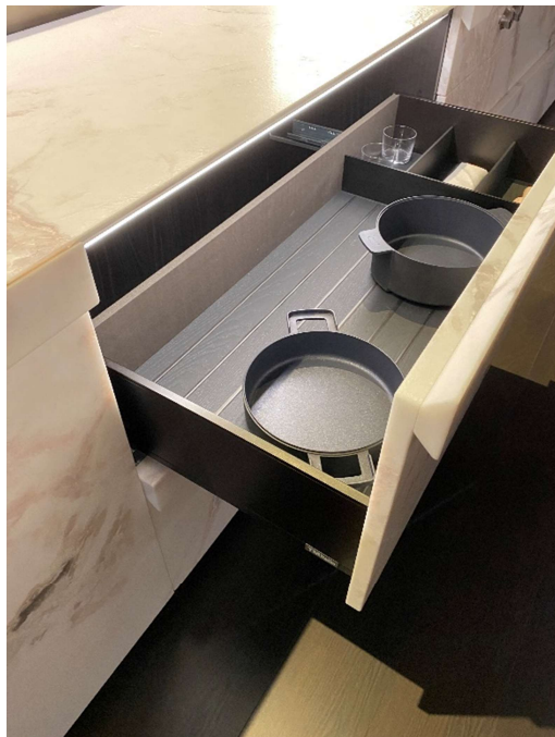
Mitered Edges/Stone fronts