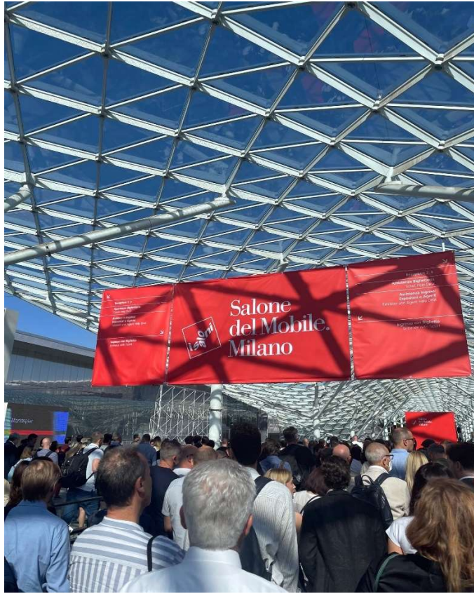
Entry to Salone del Mobile Milano

There was a lot to see this year and it was evident that there has been a shift in trends of kitchens and bathrooms. We no longer see glossy finishes and has the classic white kitchen gone away? Perhaps not, but we definitely saw it sparingly in the Salone halls. What we did see were warm, matte finish pastel tones such as sage green and taupe or rather bright, bold colours like yellow and burnt orange. Clean lines and minimalist look very much took the lead this year at the show.