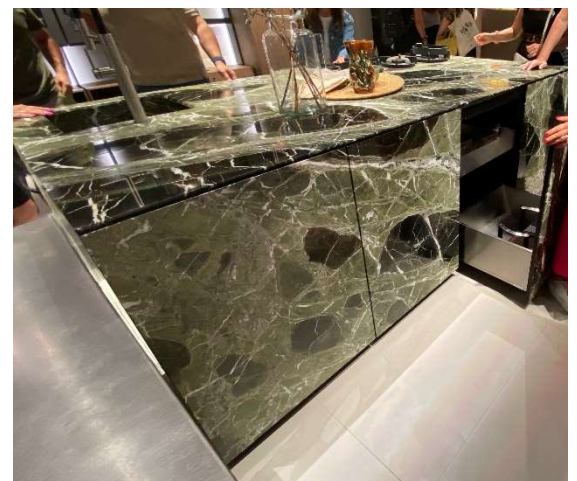
Solid surface materials (top, sides & fronts)